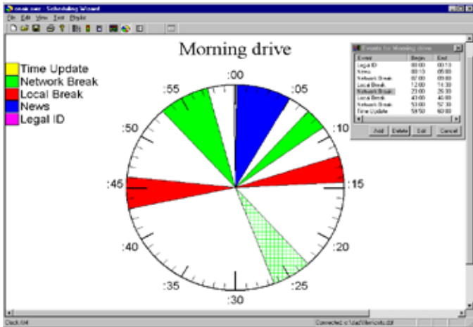
Event placement is graphically displayed on a familiar hourly program clock.

DAD's Scheduling Wizard quickly and easily creates playlists with scheduled music and/or traffic and integrates them with DAD. Scheduling Wizard operates as complete scheduling system or as an interface to popular third party scheduling systems. Utilizing simple graphical displays Scheduling Wizard greatly reduces the chance for scheduling errors and missed spots.